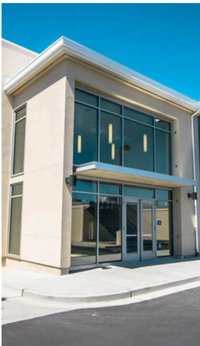
Image 2. Irvington High School